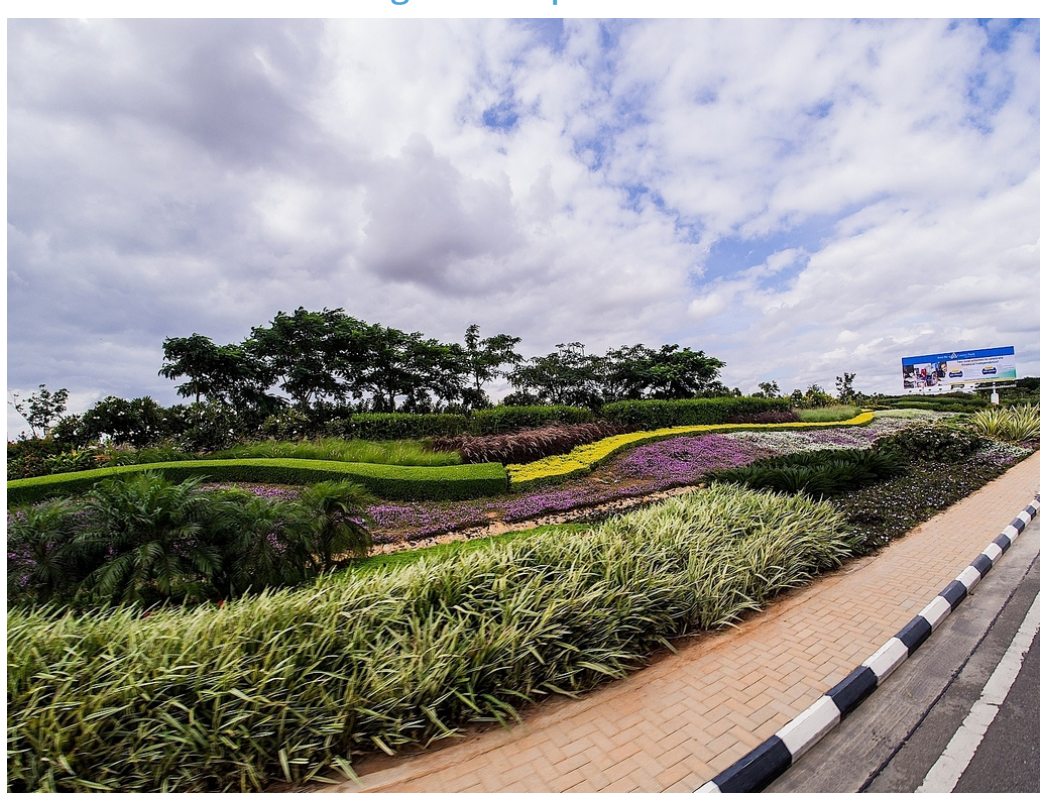
9 Hole Golf course at Hirco,chennai