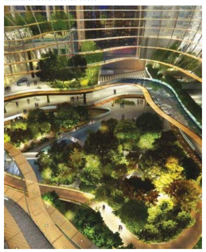
Changi Airport - JEWEL Nursery